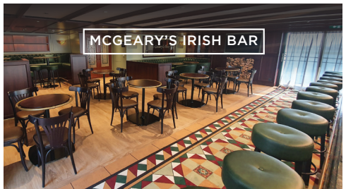
MCGEARY'S IRISH BAR